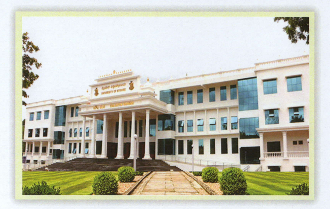
Colleges recognized under 2(f)/12(B), NAAC and CPE