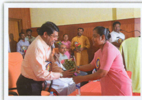
FELICITATION TO ONE OF THE DELEGATES