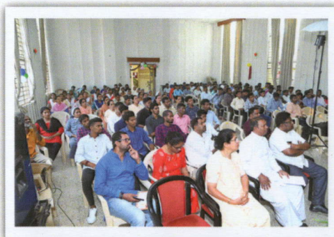
DELEGATES OF THE CONFERENCE