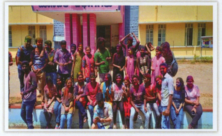
Students also take a break from their academic pursuits in the cultural festival revelry (2019)