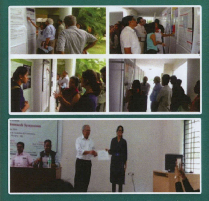
3rd Life Science Research Symposium – Presentation by participants and award for Best Presentation