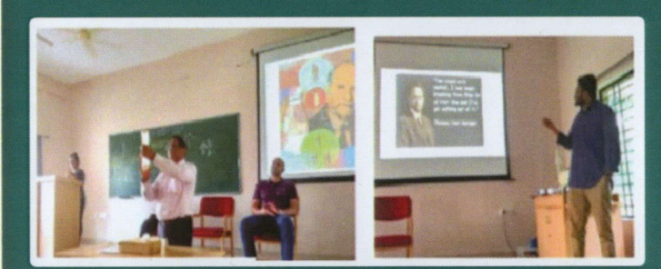
Morgan Day Celebration