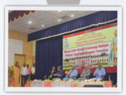
National workshop on Revisiting Pre-colonial Karnataka History: Importance of Tipu Era Mysore- 2019