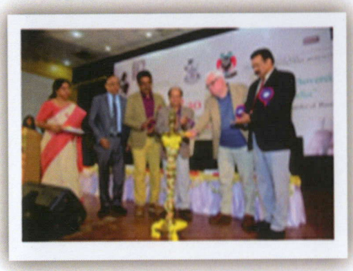
International Seminar on Princely South India 2019