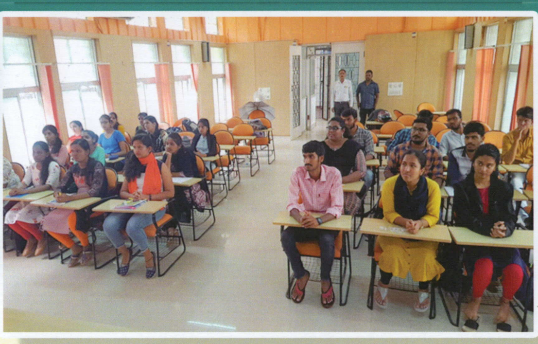
Students attending a seminar at the Seminar Hall