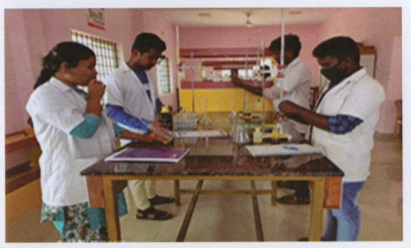
PHYSICS LAB - 2