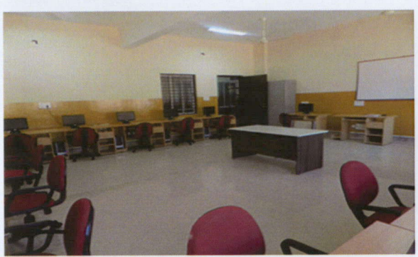
COMPUTER SCIENCE LAB