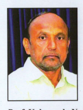
Nov 2013 to Dec 2015