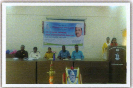
One day State level Seminar on "Babu Jagjivanram's Contributions to the Politics of Modern India"