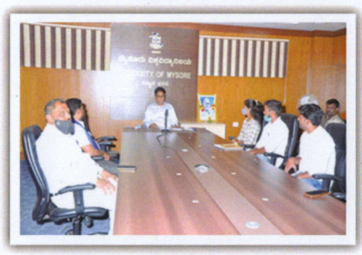
Webinar on "The Contributions of Babu Jagjivanram in the formation of Bangladesh"