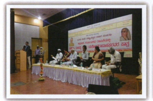
One Day State Level Seminar on "The Role of H.C. Dasappa and Yoshodhara Dasappa in Formulation of Modern Karnataka"