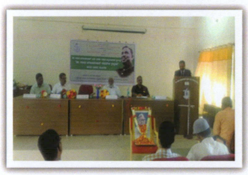
Book Release function of "The last words of Bakalamuni K.B. Siddaiah on Internal Reservation"