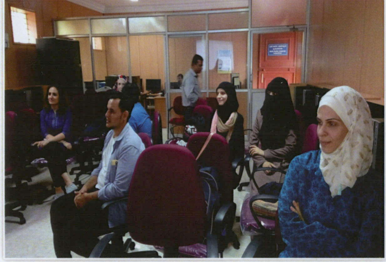
MULTI-MEDIA LANGUAGE LABORATORY