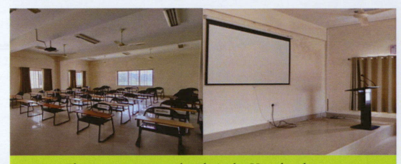
Class rooms equipped with Audio Visual aids