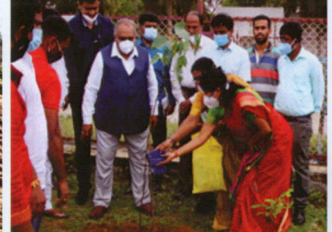
Water conservation & Tree Plantation