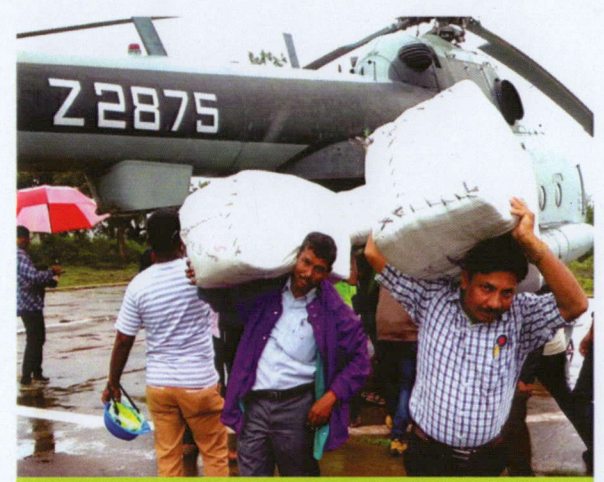
Programme Officers & Volunteers involved in flood relief work-Harangi