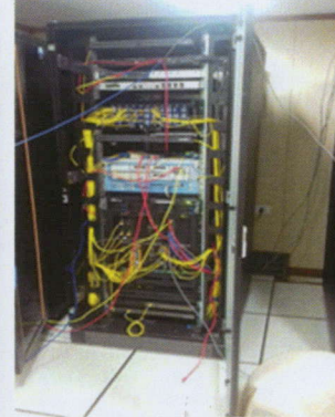
High speed server with UPS